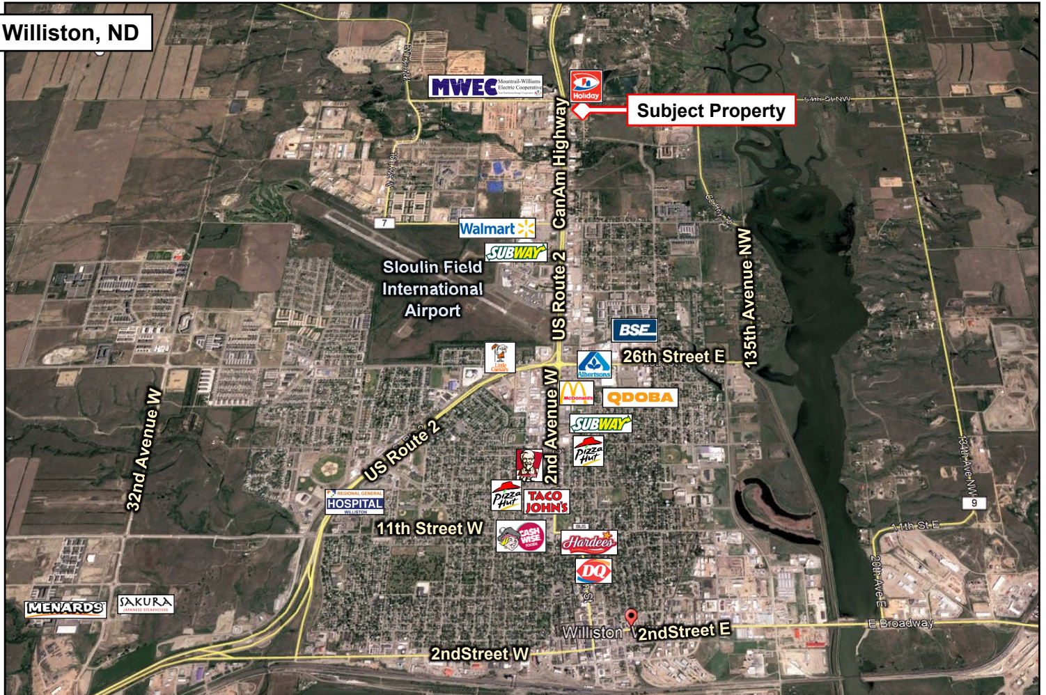
Mountrail-Williams Electric Coop