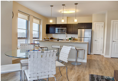
Kitchen and Dining