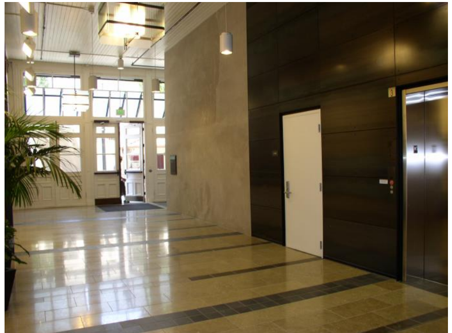
Pictured above is the first floor lobby.