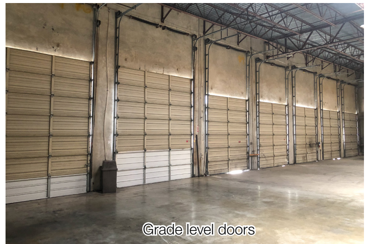
Grade level doors