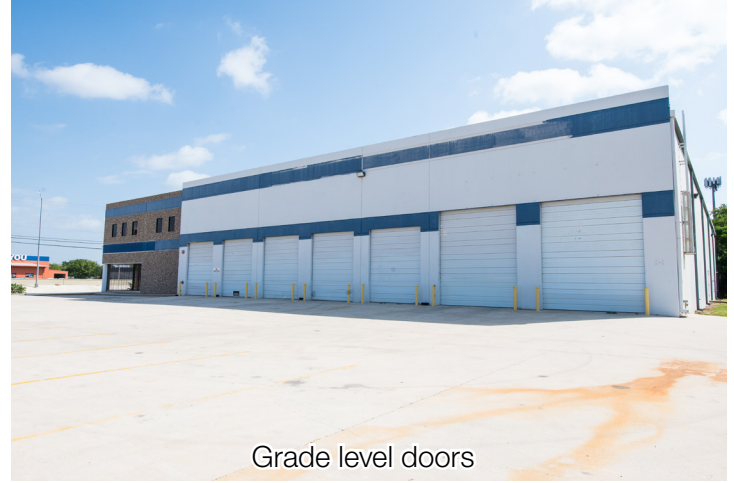
Grade level doors