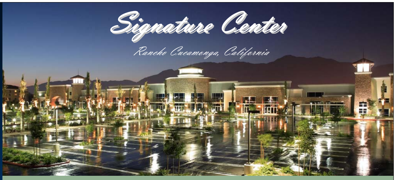
AVAILABLE FOR LEASE ± 24,063 SF