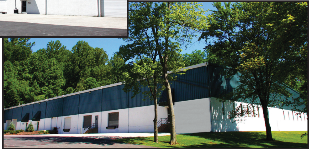
3119 Phoenixville Pike