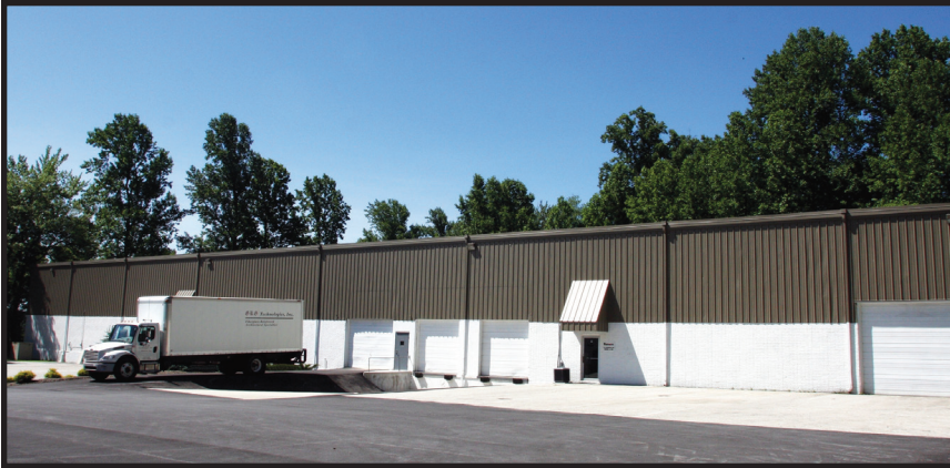
3103 Phoenixville Pike