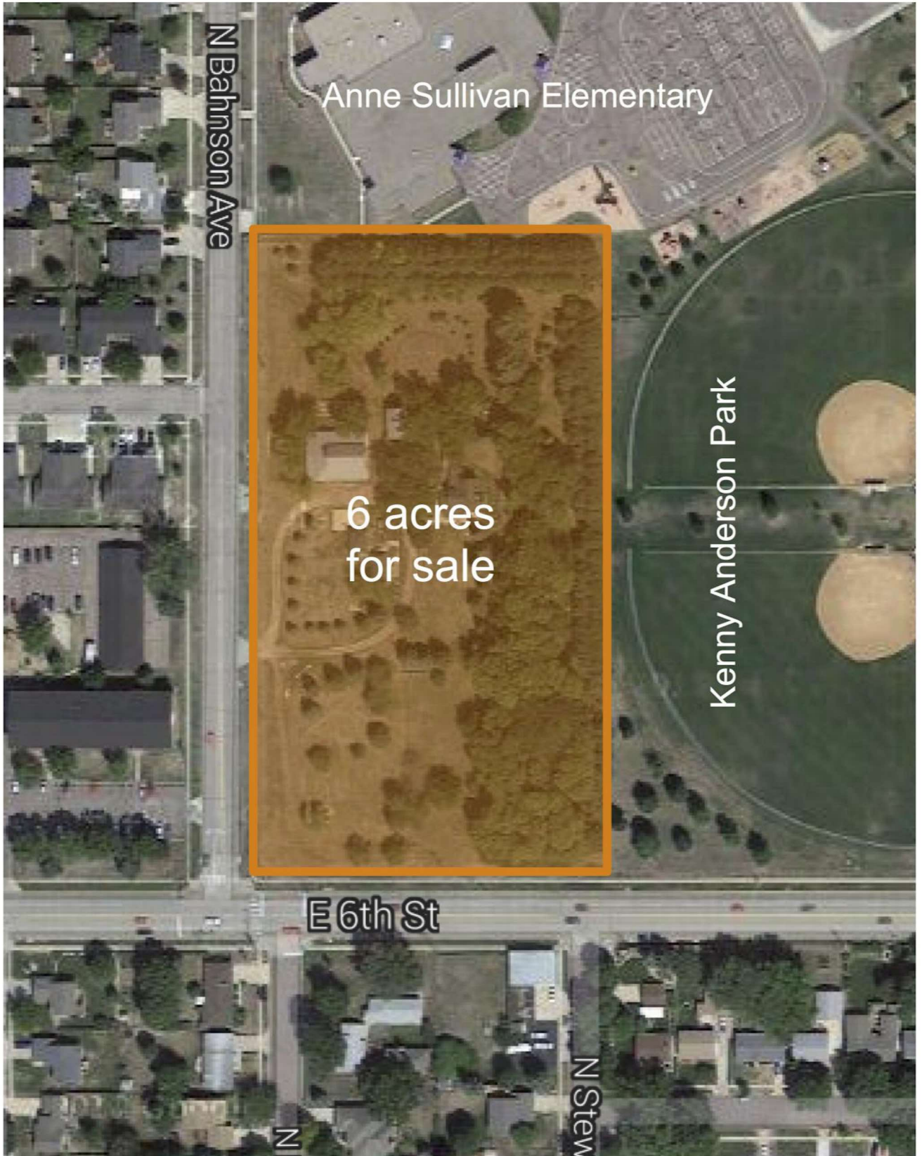
The Lacey Estate : 6th + Bahnson