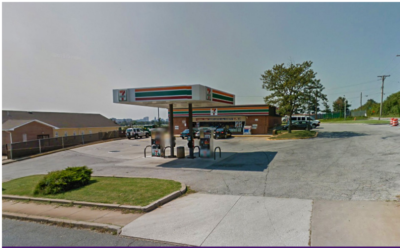
TANKS AND CANOPY REMOVED