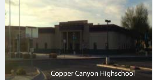
Copper Canyon High School