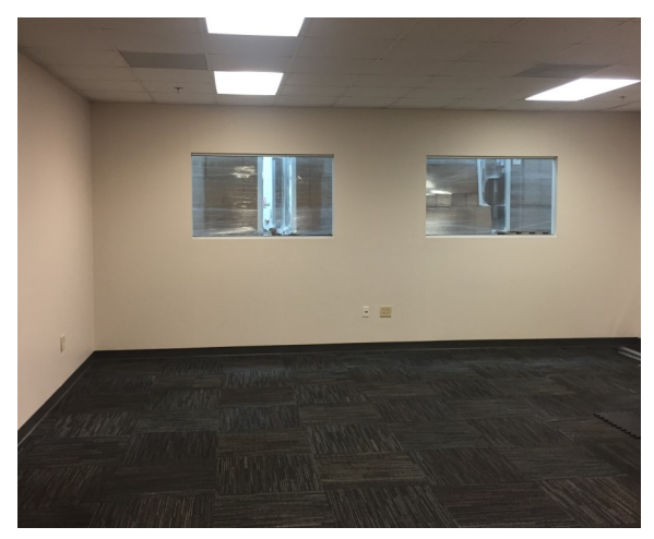
All information regarding property for sale, rental, financing is from sources deemed reliable but no warranty or representation is made as to the accuracy thereof and same is subject to change of price omissions, errors or other conditions prior to sale, lease, or withdrawal.