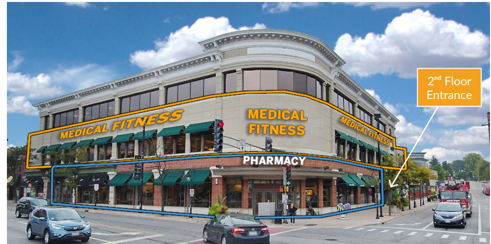
TWO TENANT SCENARIO