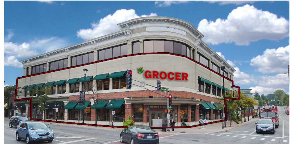
SINGLE TENANT SCENARIO