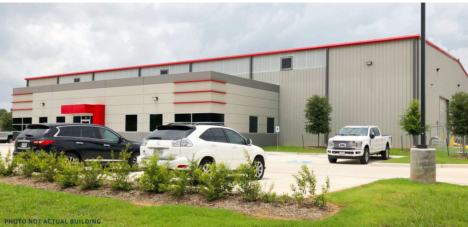
PHOTO NOT ACTUAL BUILDING