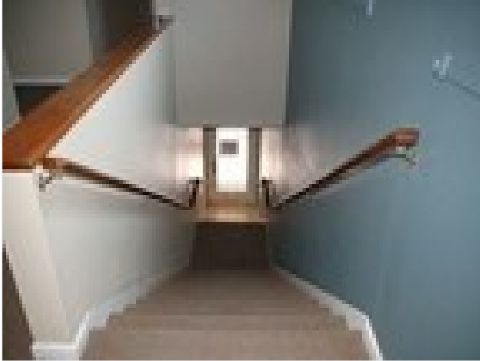
113 G Office Stairs