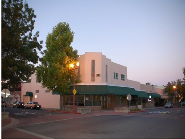
Day Corner Image