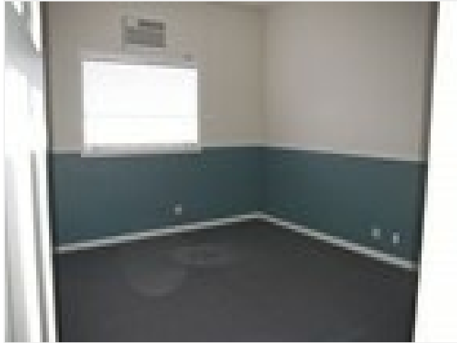
113 G Office Interior