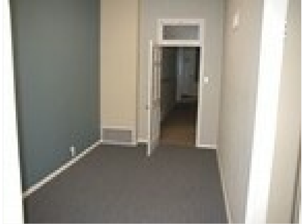
113 G Office