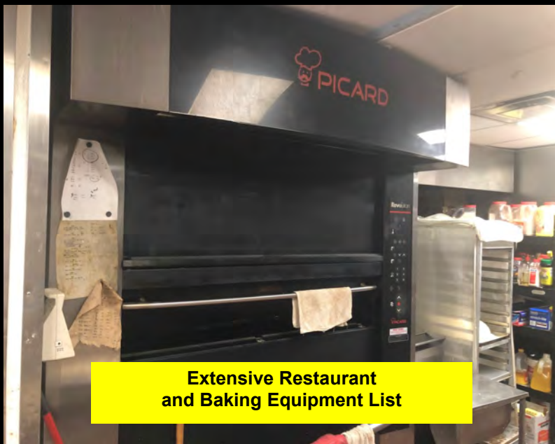
Extensive Restaurant and Baking Equipment List