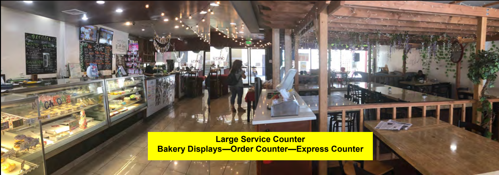
Large Service Counter Bakery Displays—Order Counter—Express Counter