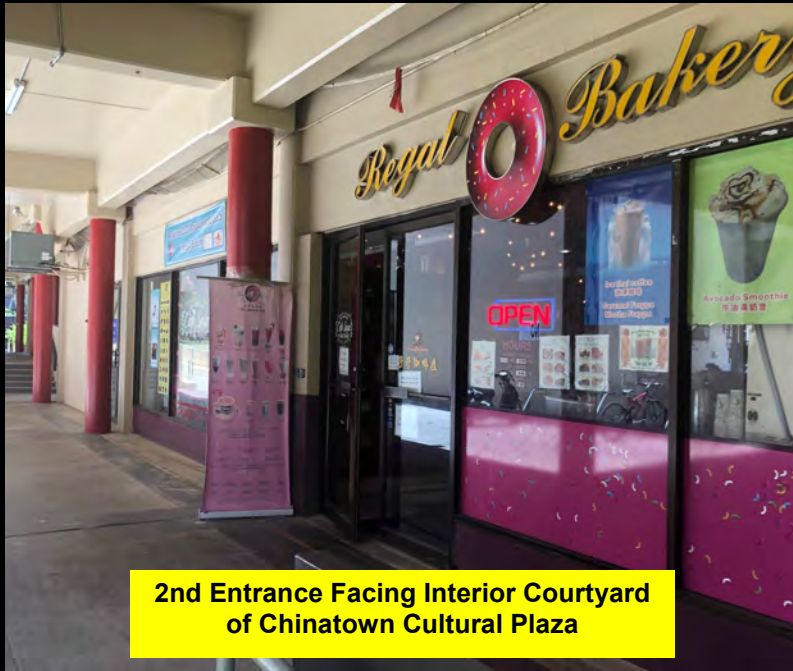
2nd Entrance Facing Interior Courtyard of Chinatown Cultural Plaza