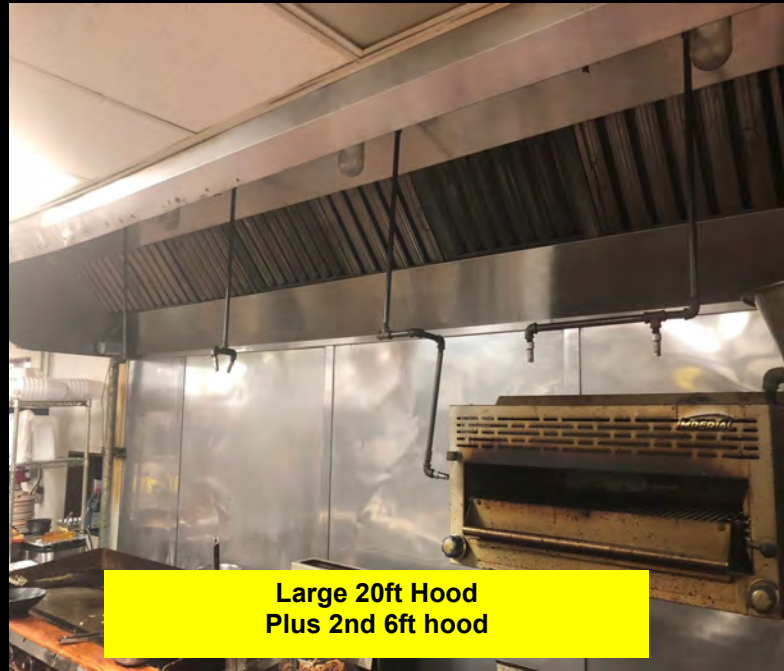
Large 20ft Hood Plus 2nd 6ft hood