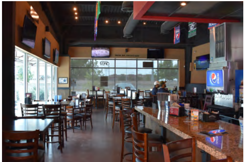
Wing Nutz Space

Taylor LeMaster | 972-764-6004 tlemaster@inroadsrealty.com