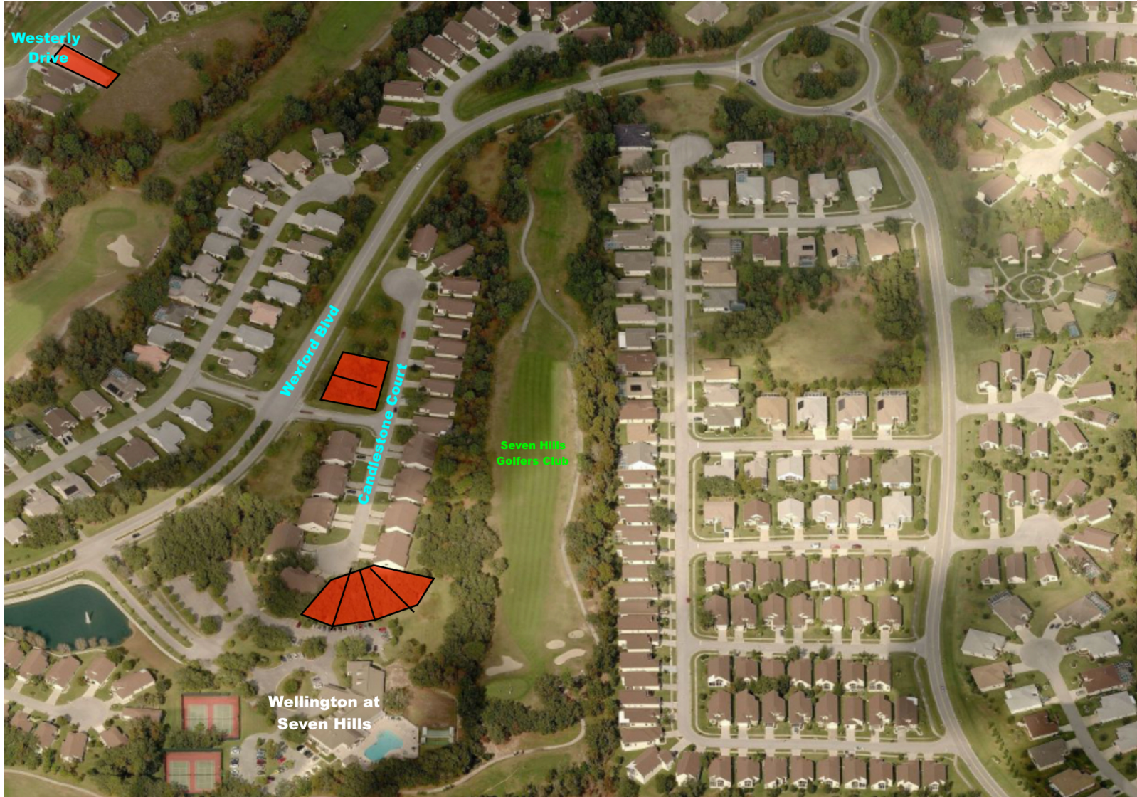
7 RESIDENTIAL LOTS AT WELLINGTON AT SEVEN HILLS // CANDLESTONE COURT, SPRING HILL, FL 34609