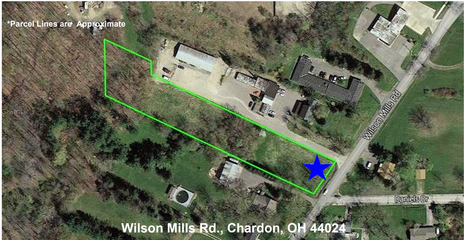
Wilson Mills Rd., Chardon, OH 44024