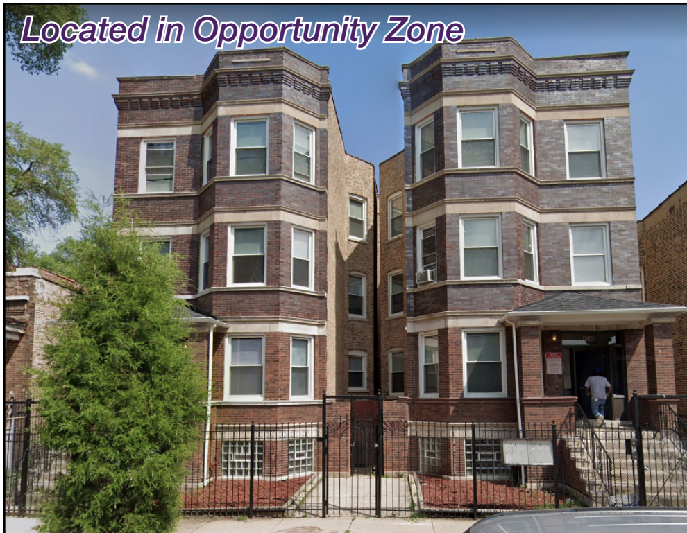
Located in Opportunity Zone