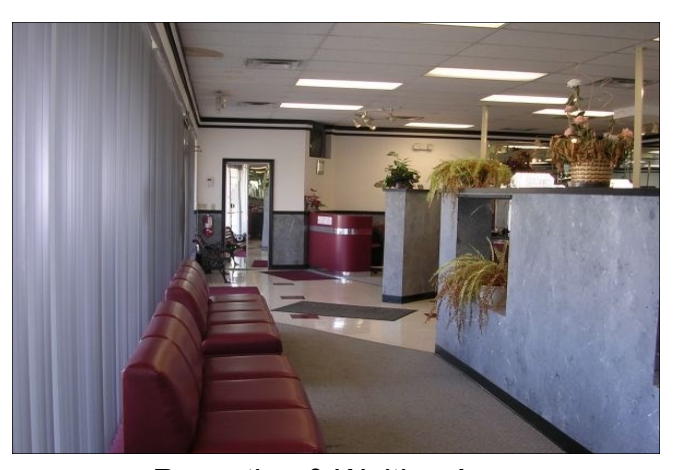
Reception & Waiting Area