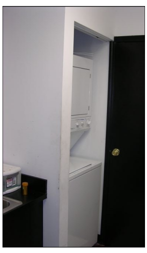
Washer & Dryer