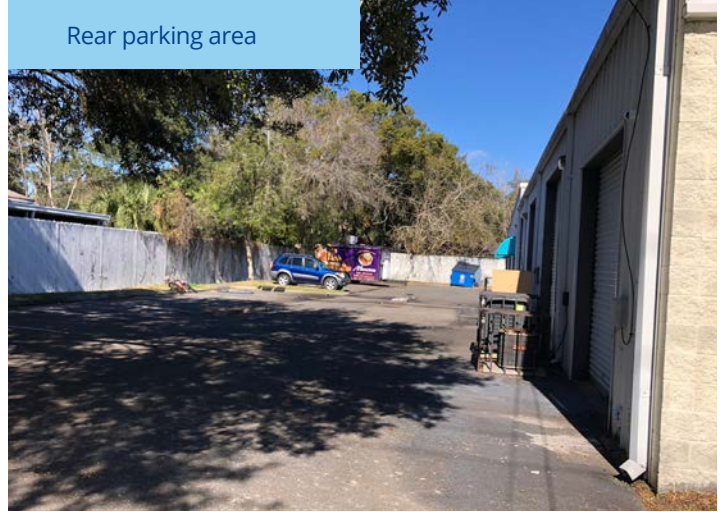
Rear parking area