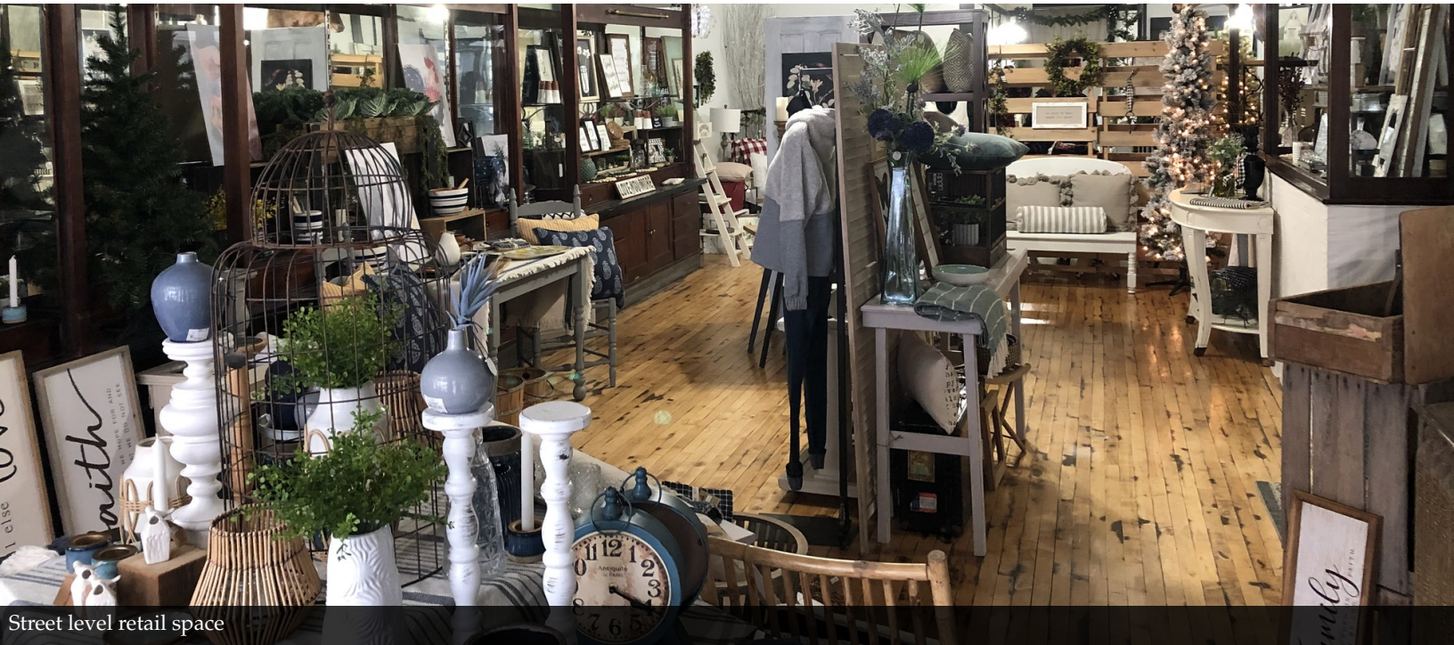
Street level retail space

212 S. LAFAYETTE ST. | FOR SALE OR LEASE