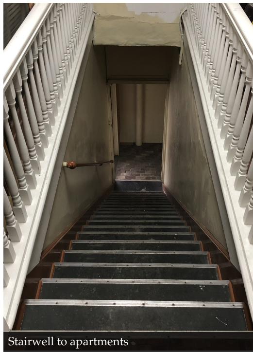
Stairwell to apartments