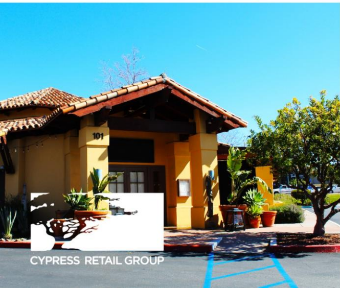
CYPRESS RETAIL GROUP

For Lease | Approx. 1,600 - 3,200 SF | Approx. 10,440 SF