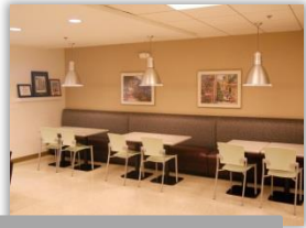
Shared Conference Room & Cafeteria