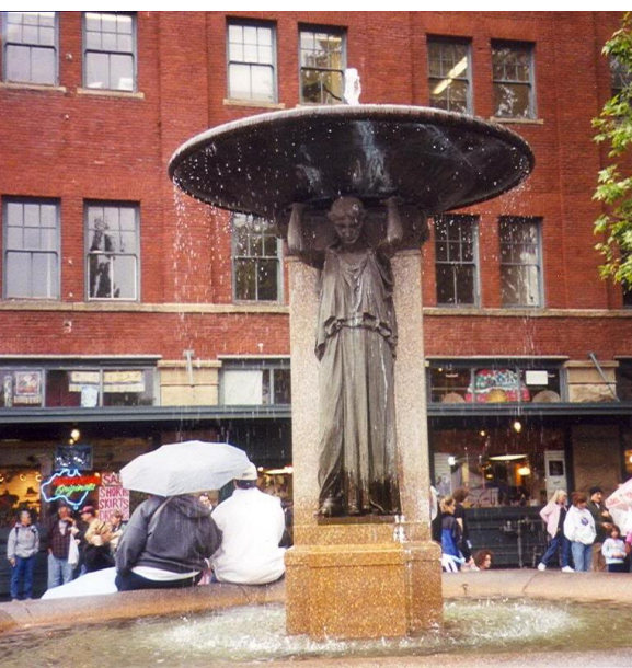
RESTORED NAITO FRONTAGE

The Hallock & McMillan building, as it was first known, is downtown Portland's first brick commercial structure, according to records kept by the Architectural Heritage Center. The building was erected two years before Oregon became a state and only six years after Portland was incorporated as a city.