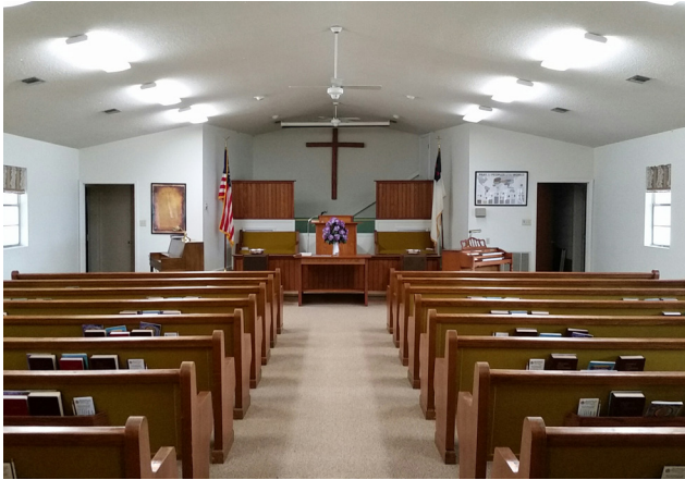
Sanctuary Rear View