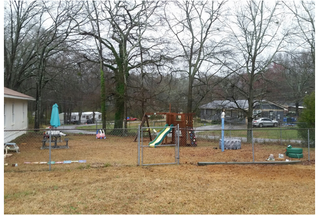
Fenced Children's Play Area