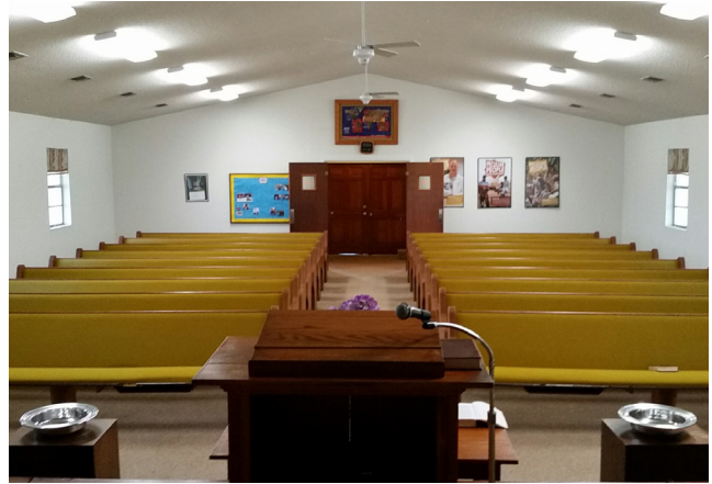
Sanctuary Front View