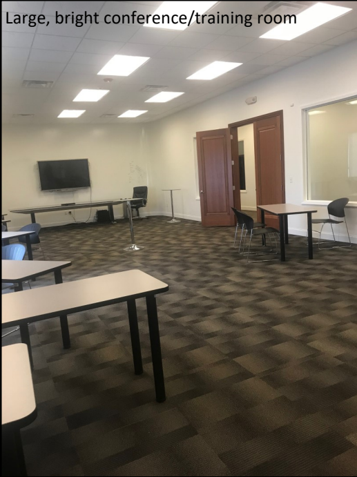
Large, bright conference/training room