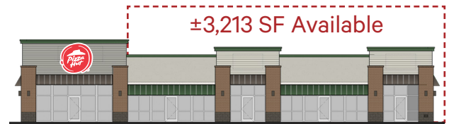
Front of Building Elevation