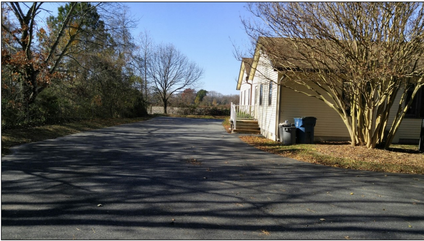
Property is subject is to price change, correction, error, omission, prior sale and withdrawal without notice. Information is from sources considered to be reliable, but is not guaranteed.