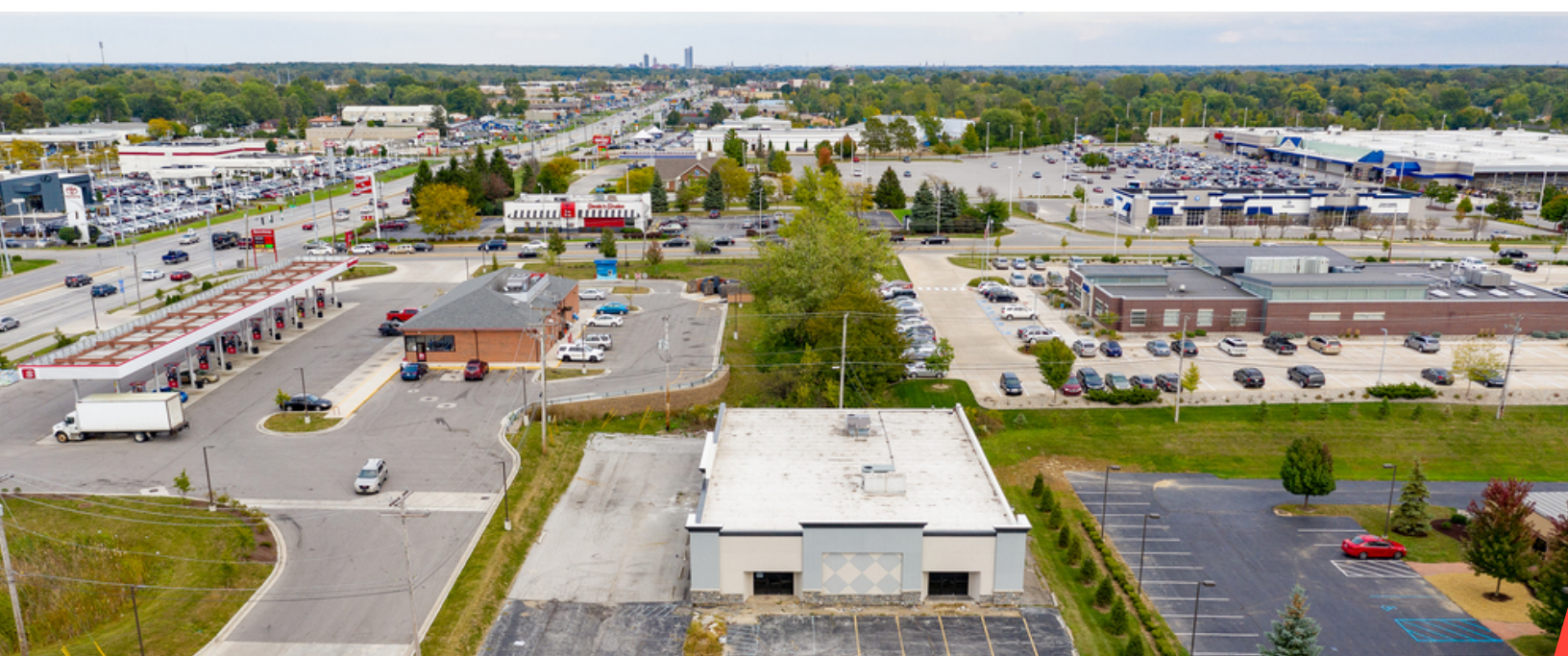
Close proximity to all major retailers along the Illinois Rd retail corridor