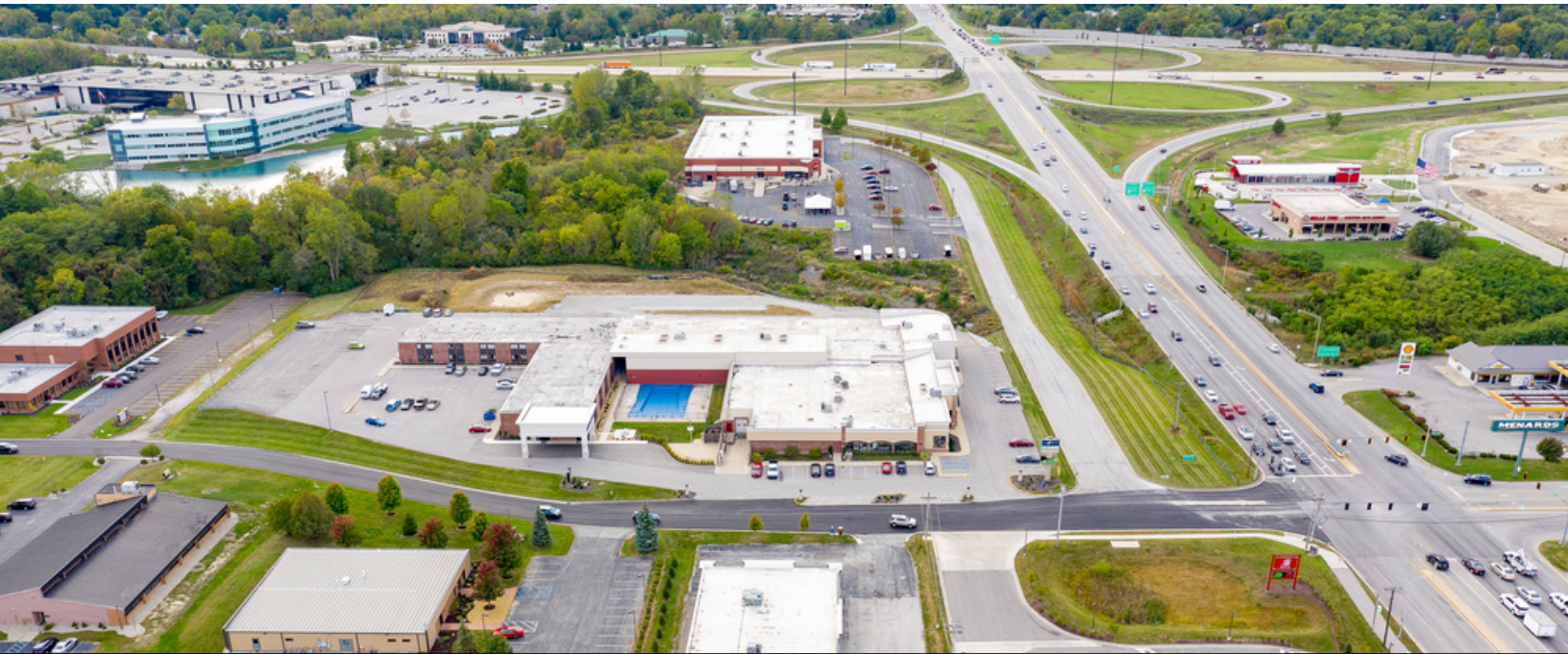
Direct access to Interstate 69