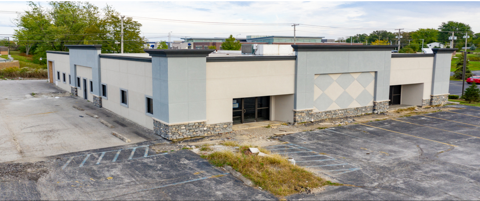
Renovation in 2019