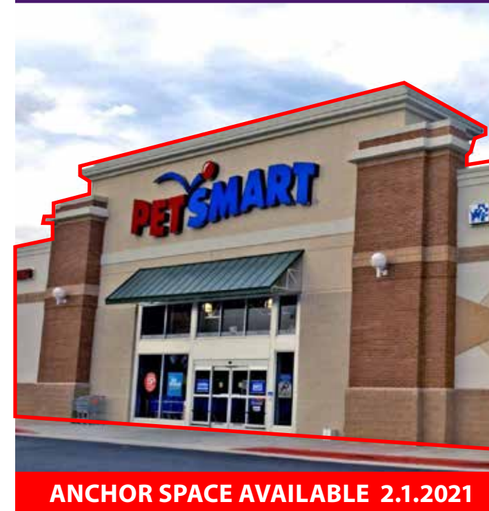
ANCHOR SPACE AVAILABLE 2.1.2021

5,376 SF 2nd Generation Restaurant Space Available