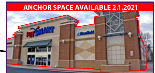
ANCHOR SPACE AVAILABLE 2.1.2021