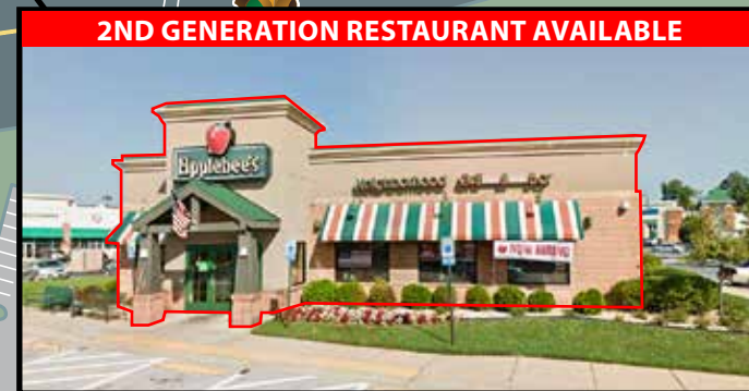
2ND GENERATION RESTAURANT AVAILABLE