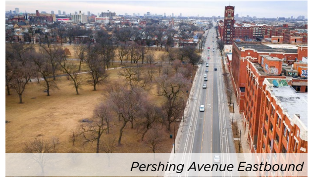
Pershing Avenue Eastbound