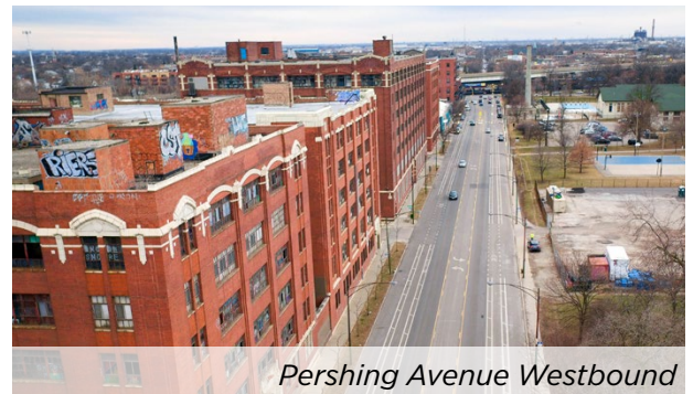
Pershing Avenue Westbound