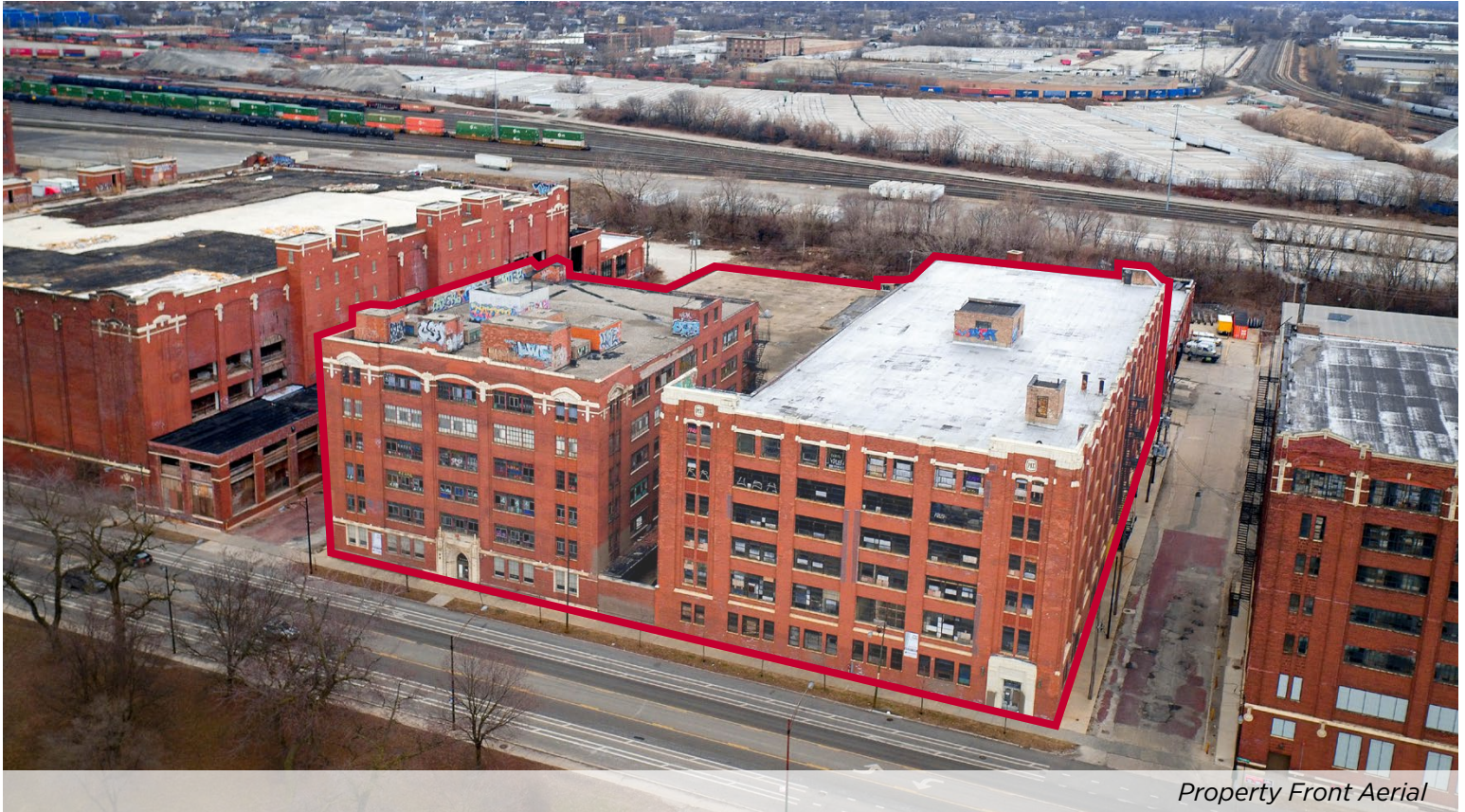
Property Front Aerial

2133-2159 W. Pershing Road CHICAGO, IL 60609