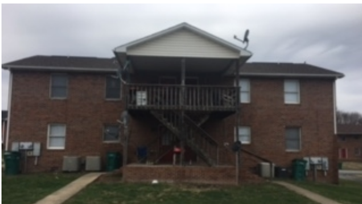
Back View of Building