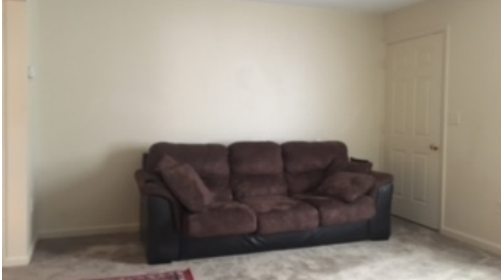
One of 4 Living Rooms