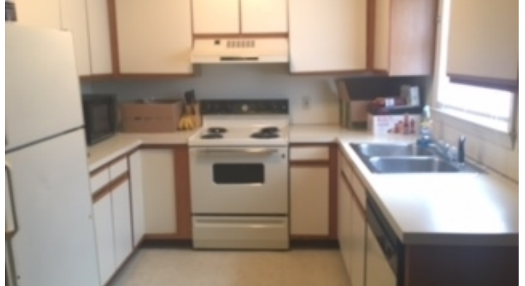
One of 4 Kitchens