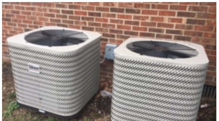
Three New Heat Pumps