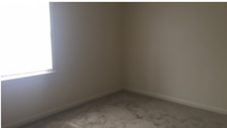
One of 8 Bedrooms