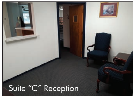
Suite "C" Reception