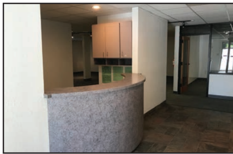
Suite "A" Reception