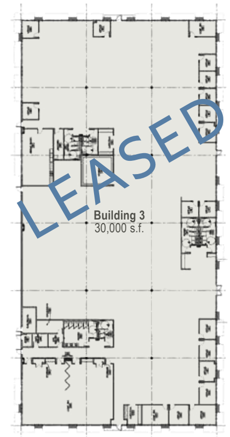
Building 3 – 2290 West Guadalupe Road