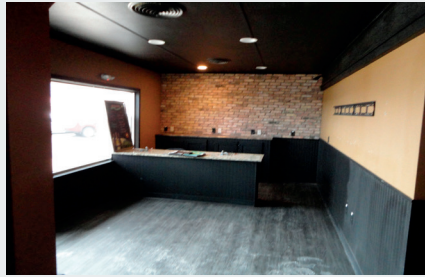
Entrance - Vacant