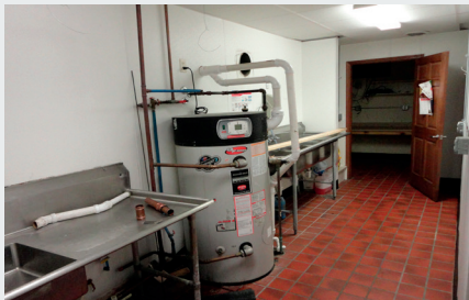
Kitchen - Vacant