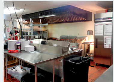
Food Prep - Occupied