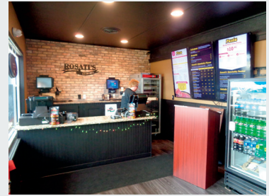
Entrance - Occupied