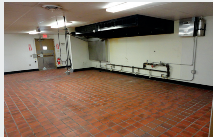
Food Prep - Vacant