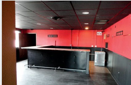
Bar - Vacant