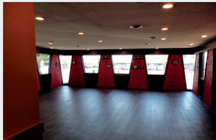
Dining - Vacant