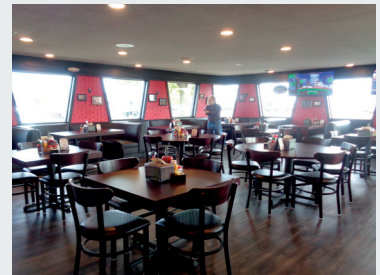
Dining - Occupied