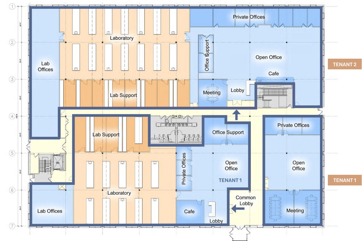
POTENTIAL MULTI-TENANT PLAN