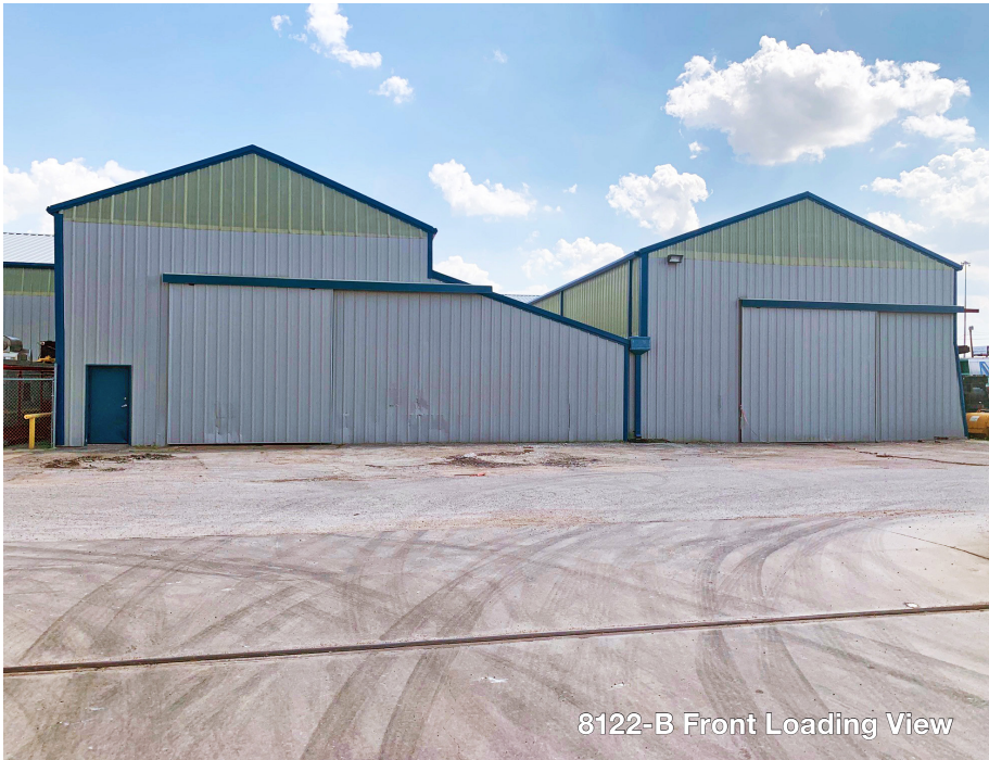
8122-B Front Loading View