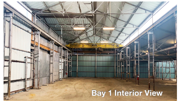
Bay 1 Interior View