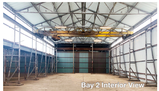
Bay 2 Interior View

Clay Pritchett, SIOR Partner tel 713 985 4631 clay.pritchett@naipartners.com