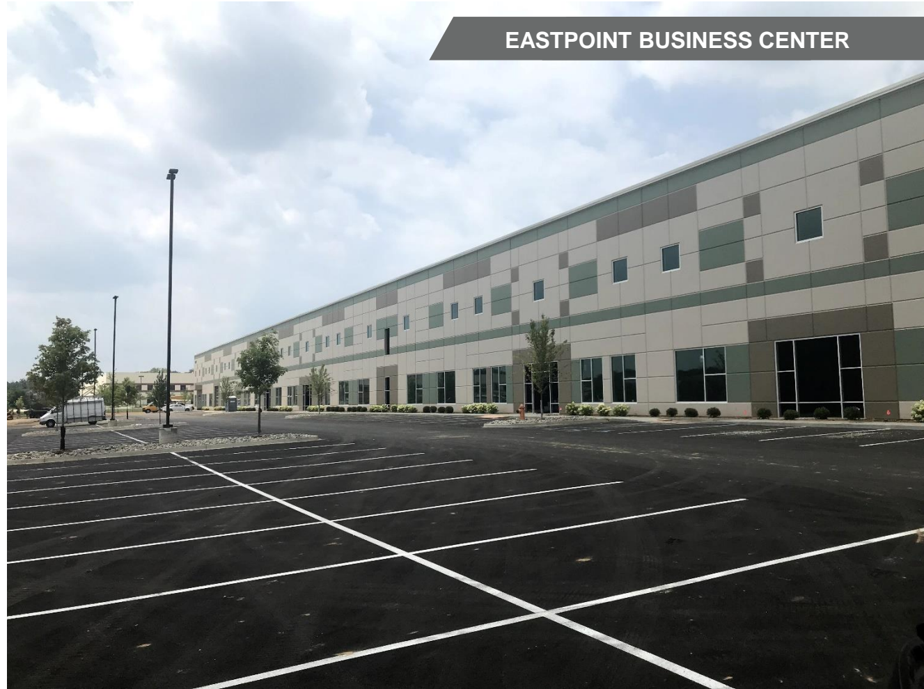
EASTPOINT BUSINESS CENTER