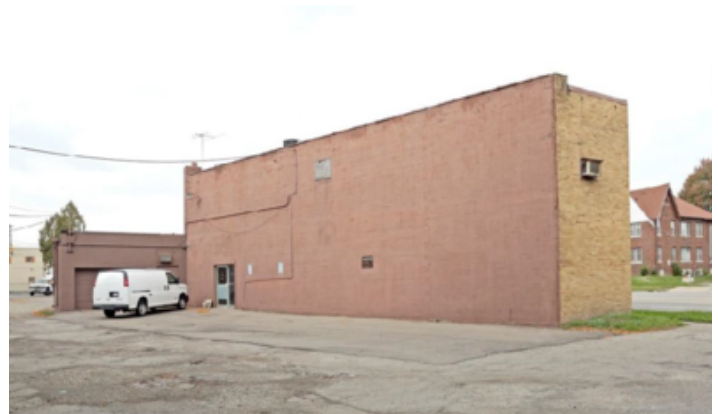
825 W Huron