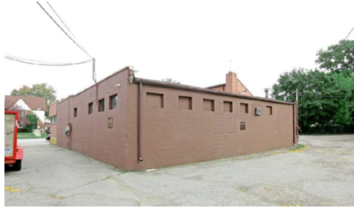
825 W Huron