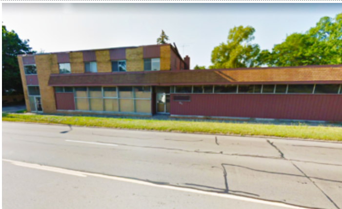
825 W Huron2