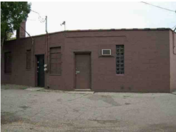
821 W Huron