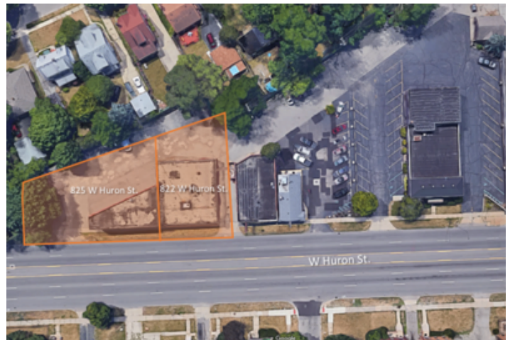
Huron St Aerial