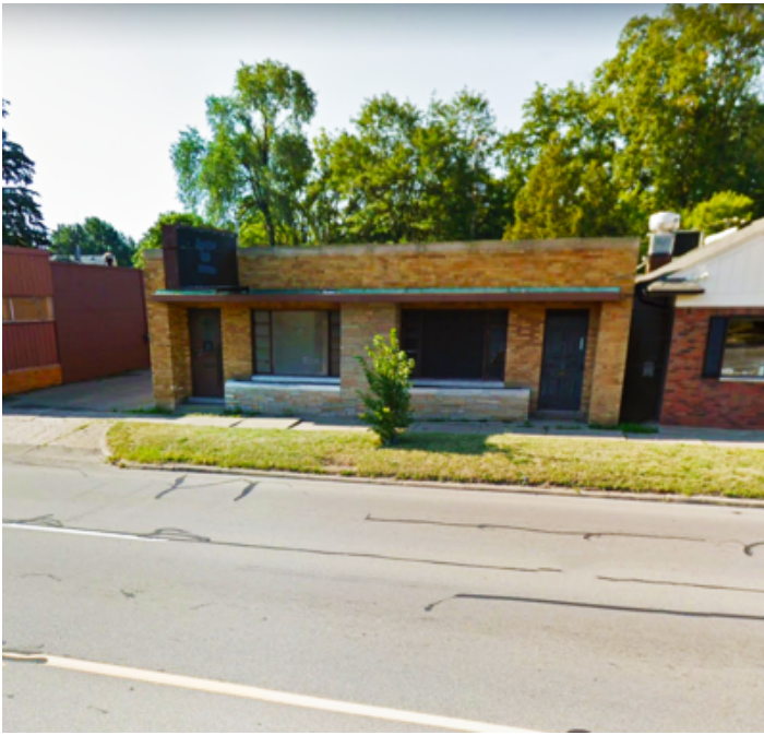
821 W Huron St2