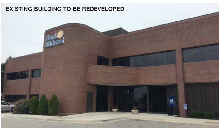
EXISTING BUILDING TO BE REDEVELOPED