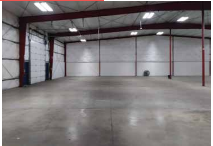
SUITE A: WAREHOUSE