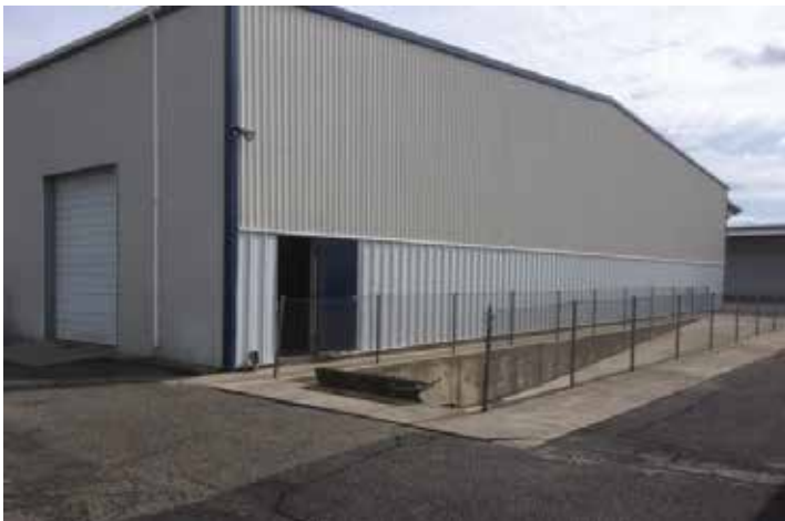
WAREHOUSE LOADING DOCK