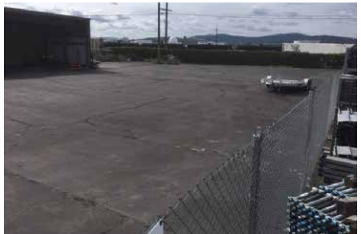
OPTIONAL FENCED YARD