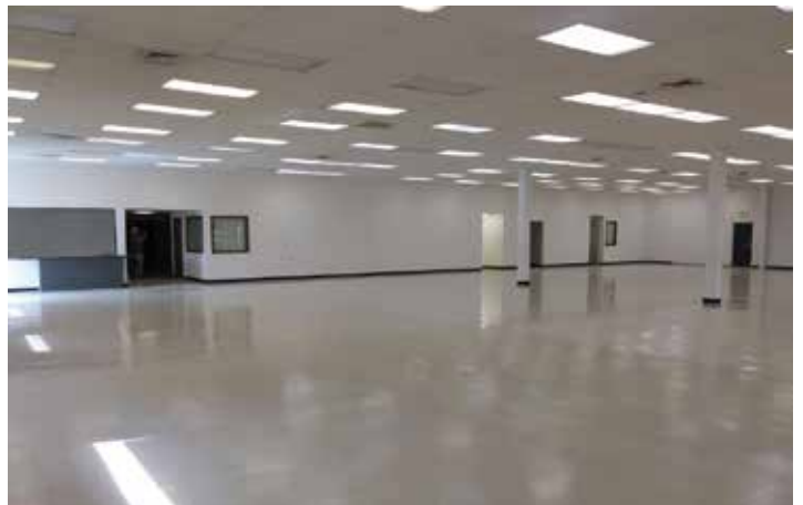
SUITE B: SHOWROOM