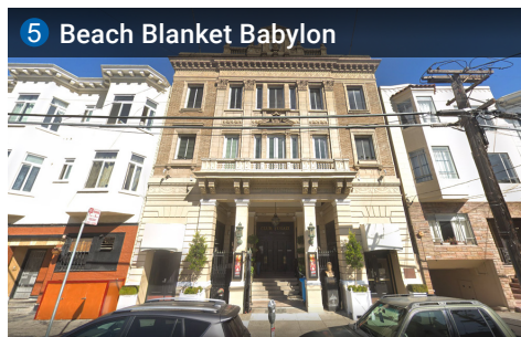
5 Beach Blanket Babylon