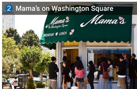
2 Mama's on Washington Square