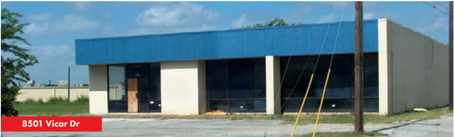
8501 Vicar Dr