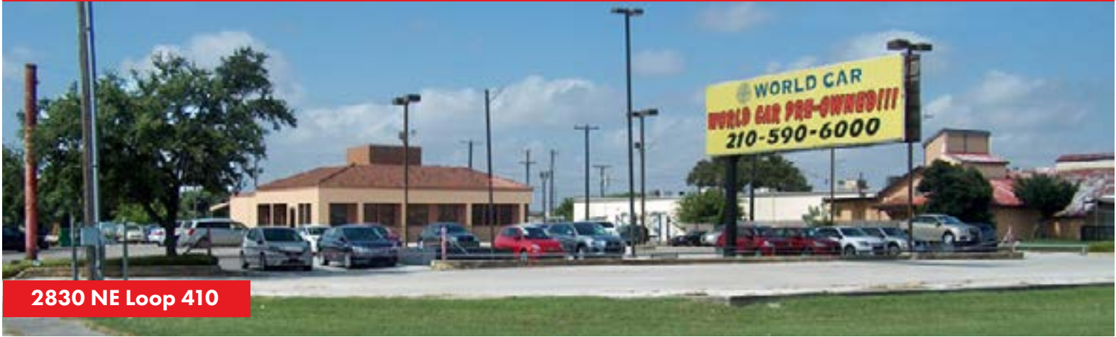
2830 NE Loop 410

2830 NE LOOP 410 AT VICAR DR | SAN ANTONIO, TX 78218