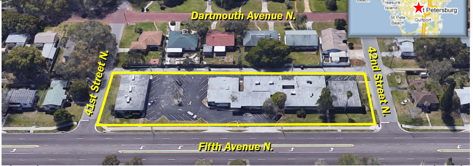
5th Avenue N