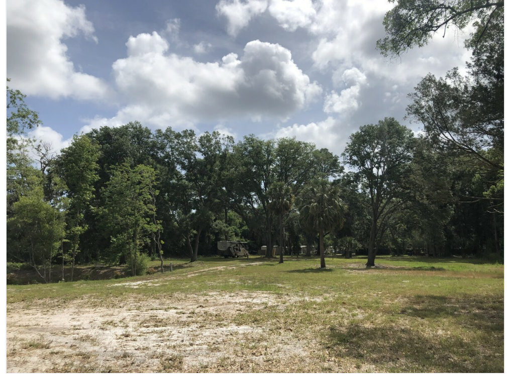
C - Cleared Parcels