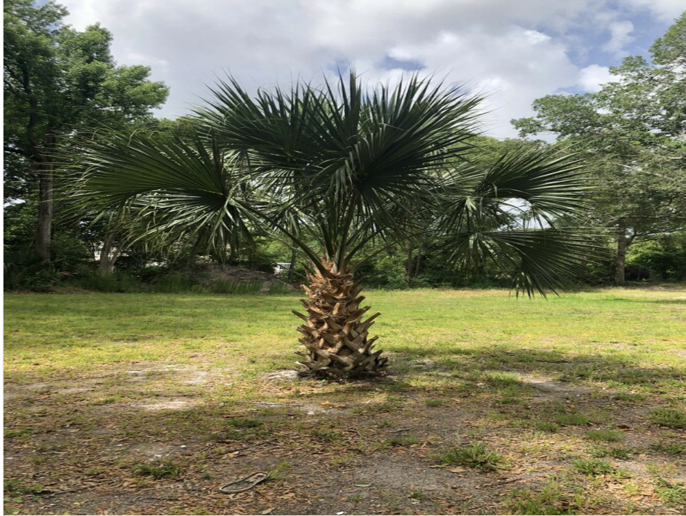
D - Palm