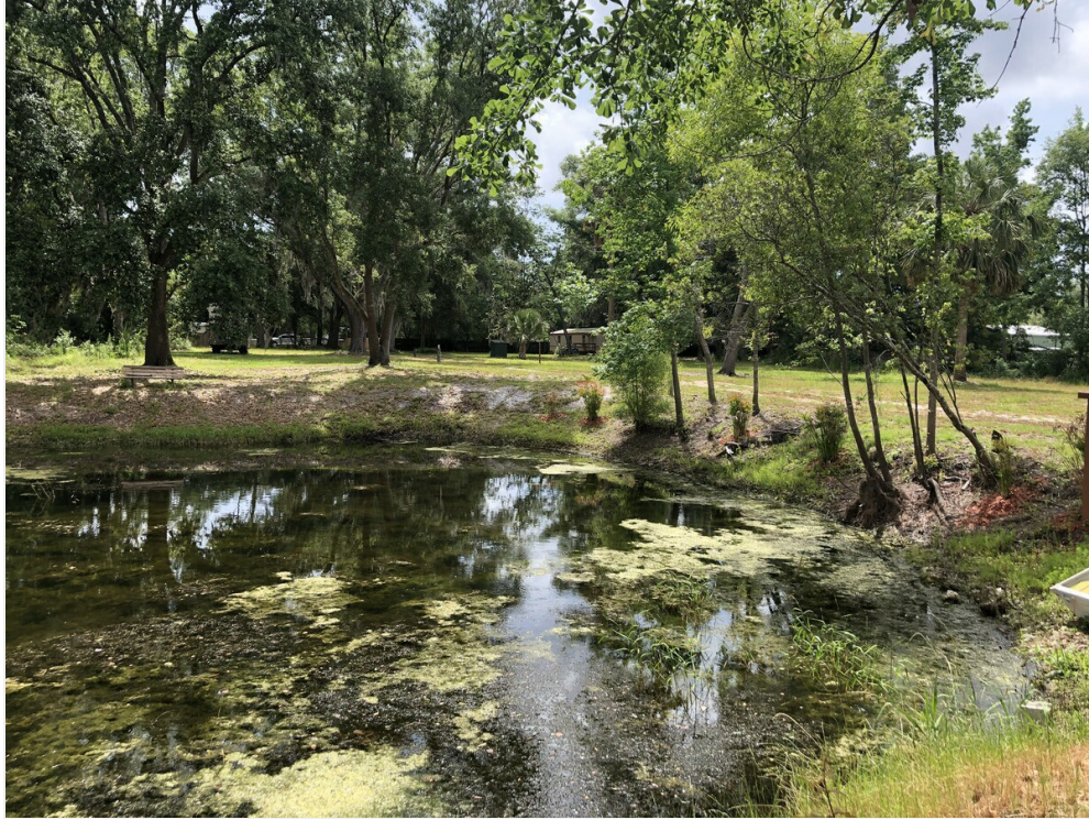
H - Pond