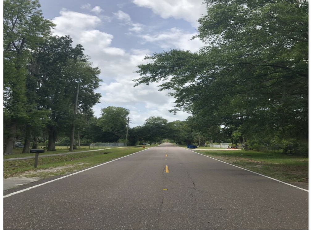
K - Dunn Creek Road