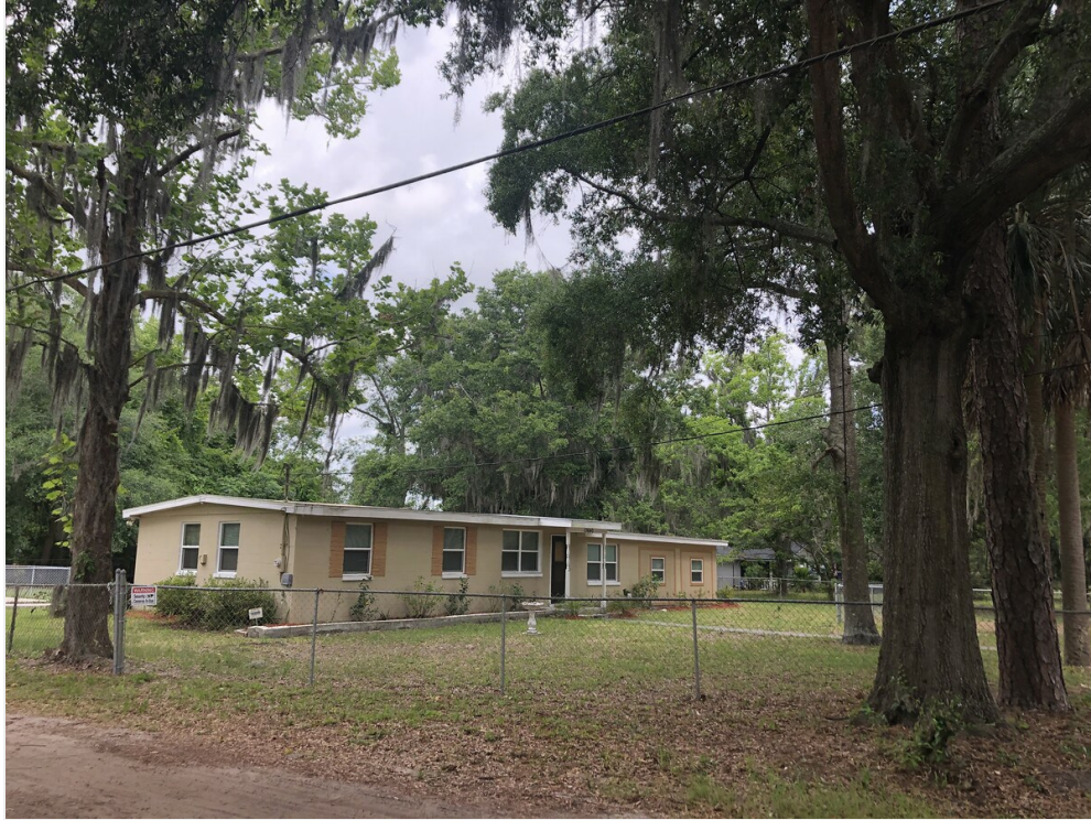
J - Parcel Homestead