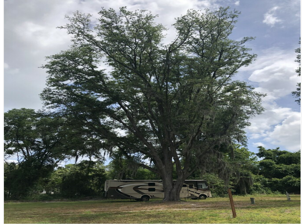
G - Open Area