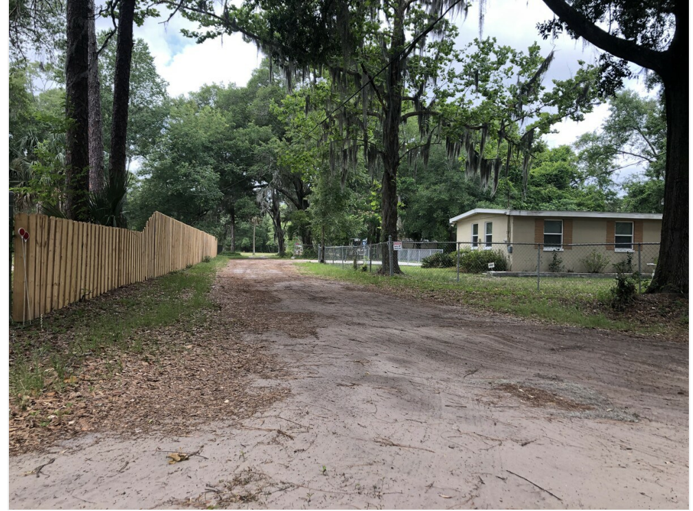
I - Parcel Entry