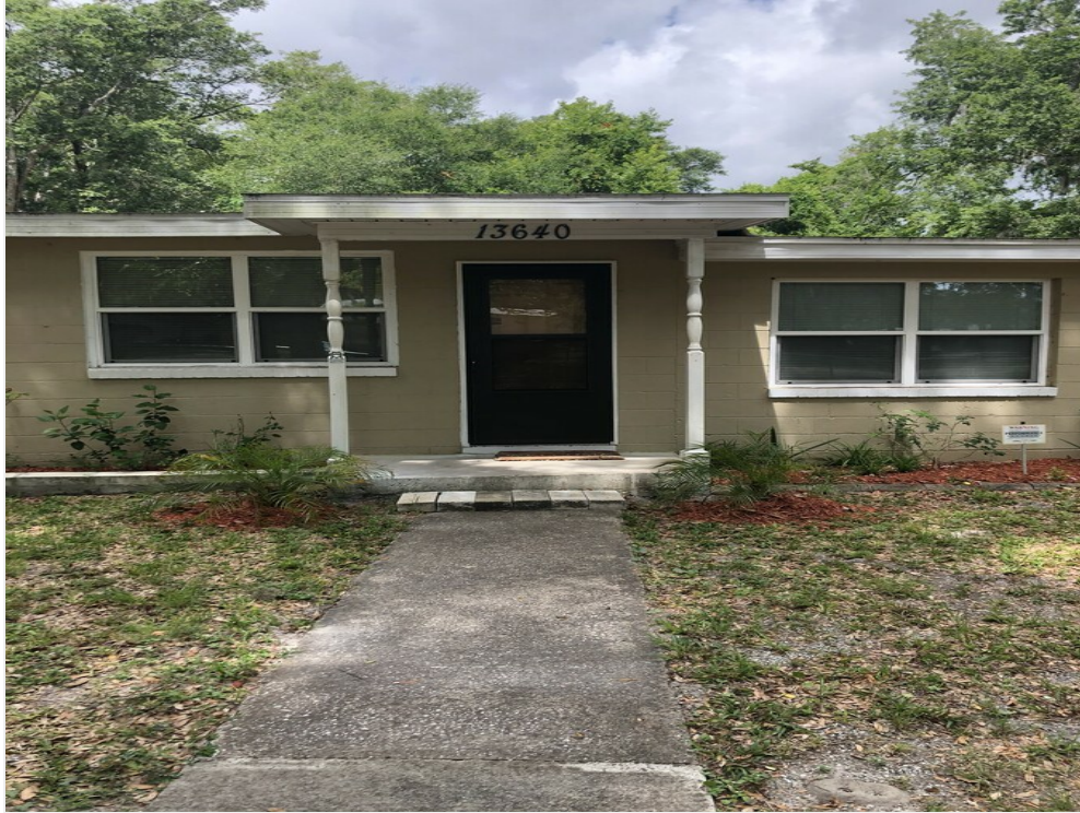
L - 13640 Dunn Creek Road