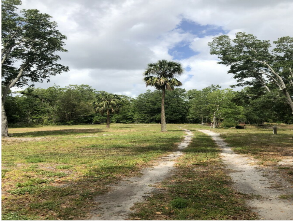
B - Cleared Parcels With Natural Palms