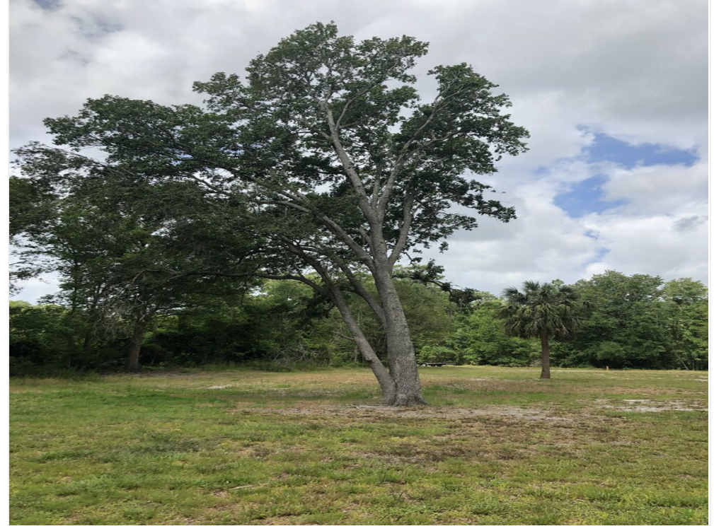
E - Open Area