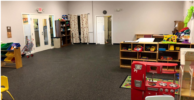
END CAP INTERIOR