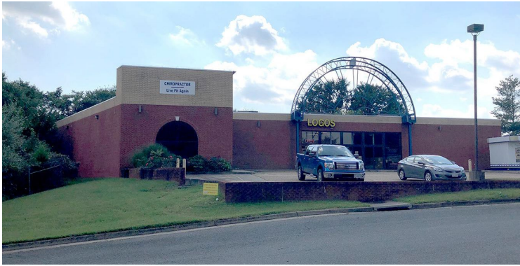
FRONT VIEW FROM AMOS LANE