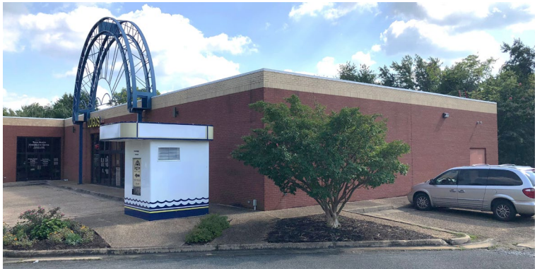
END CAP AVAILABLE. OWNER TO WORK WITH TENANT ON LOCATION TO BUILD STORE ENTRANCE.