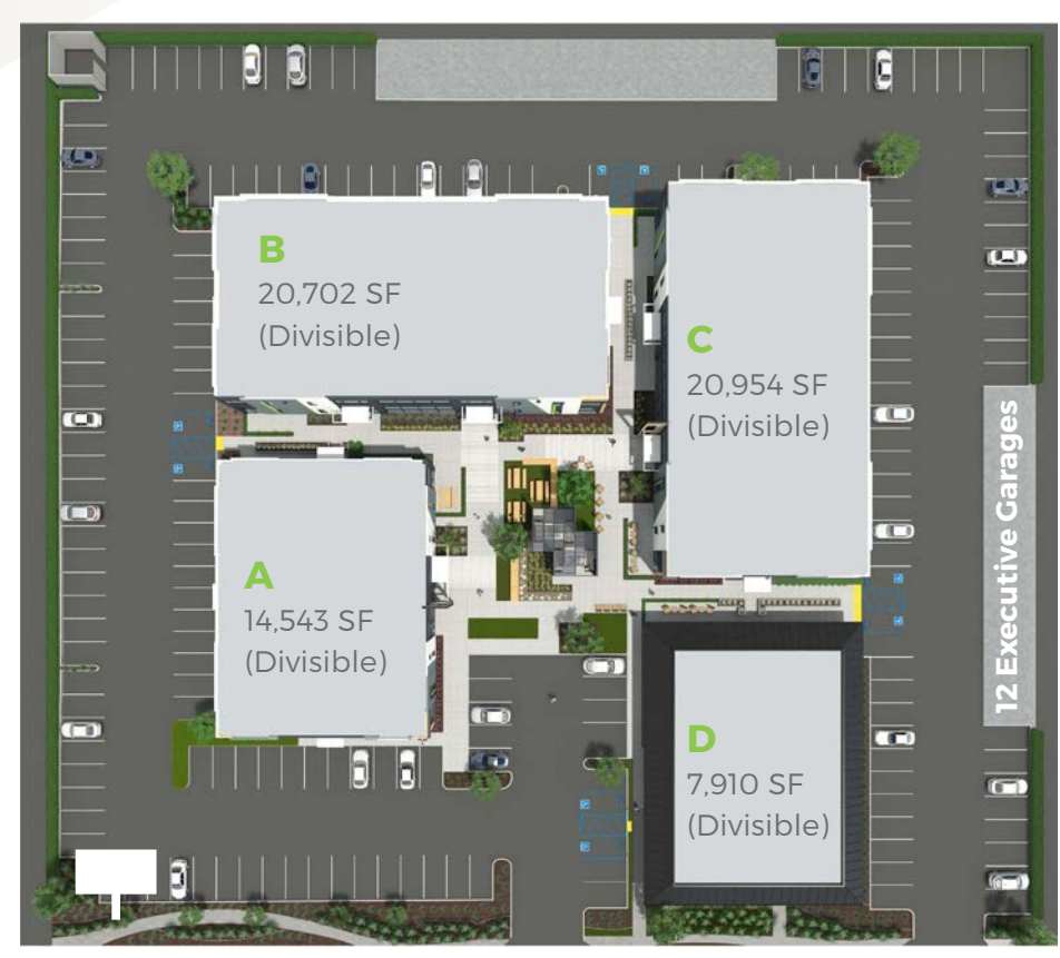
Multiple Signage Opportunities