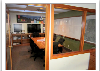
Exterior Photos ↓