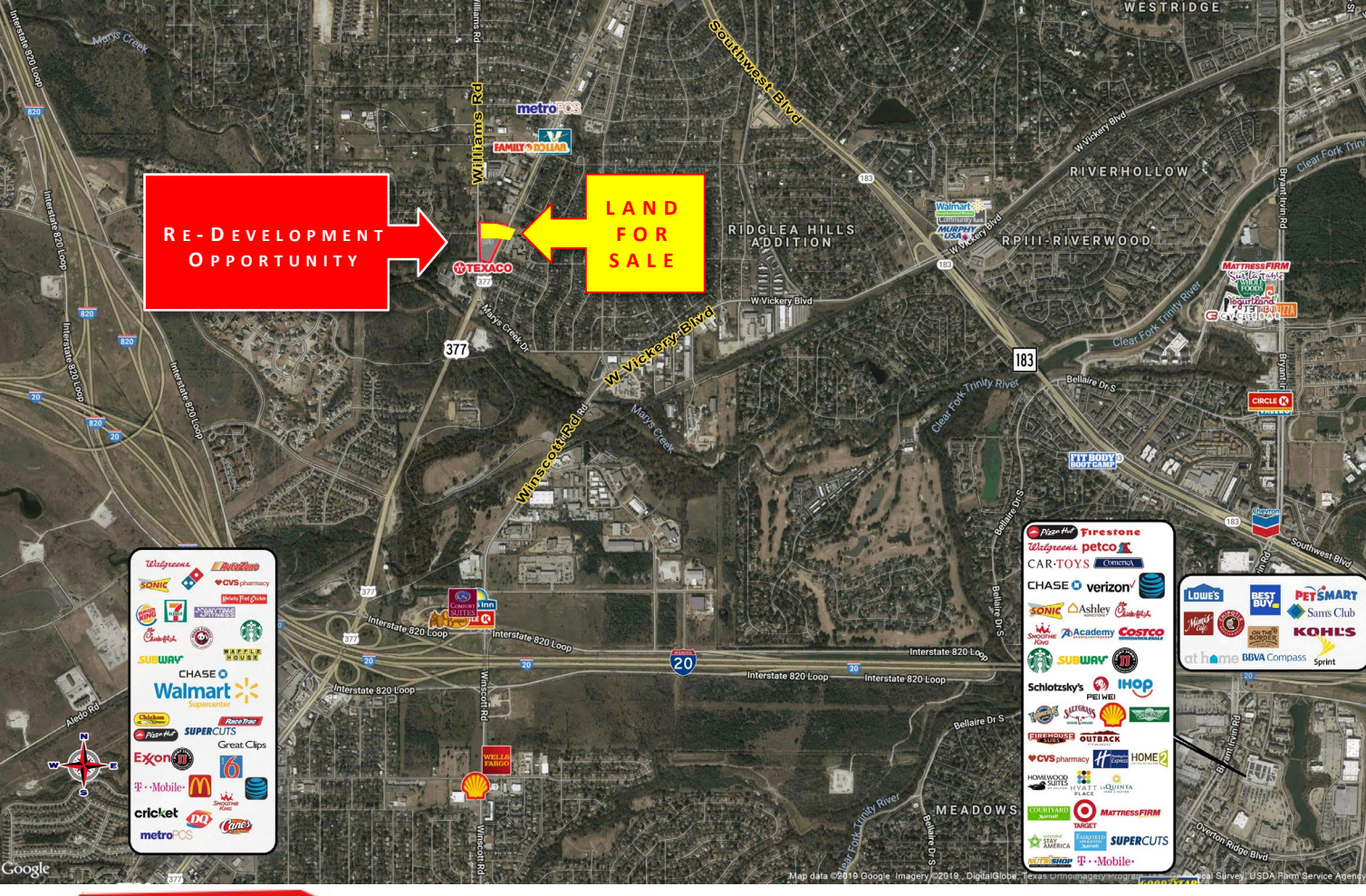
Note: No surface or sub-surface mineral rights included with land