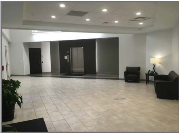
Newly Renovated Lobby