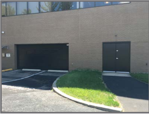
Grade Level Access