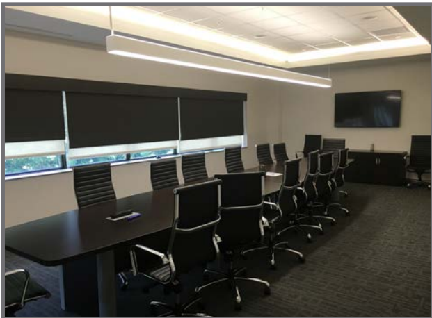
Shared Conference Space