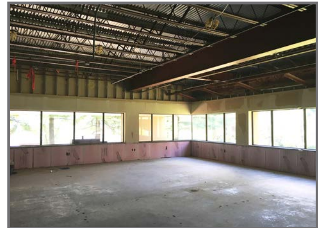
Exposed Ceilings - Corner Suite