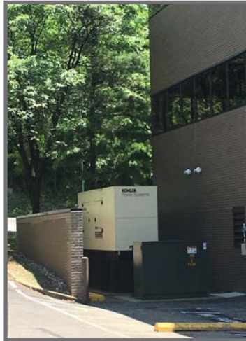
Back-Up Generator (200 KW, 301 AMP Diesel)