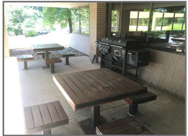
Shared Patio / Event Space