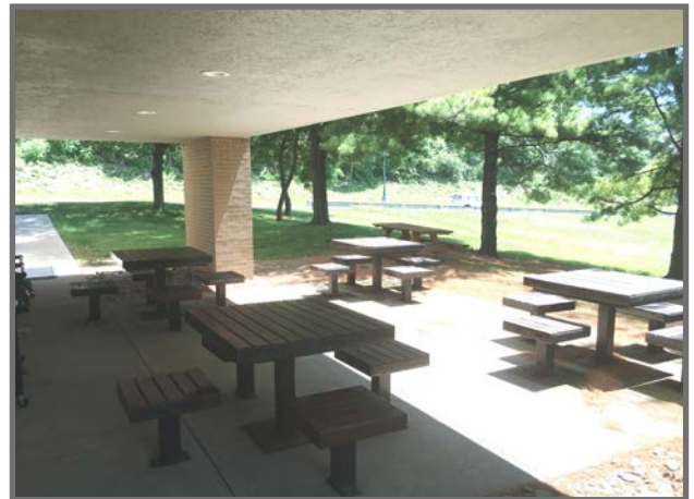
Shared Patio / Event Space